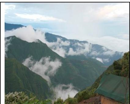
CHILL AT THE CAMP